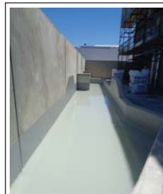
M-Construction, Carr Place, Leederville, Perth

Waterproofing of suspended slab including the communal garden area, garden beds and retaining walls.